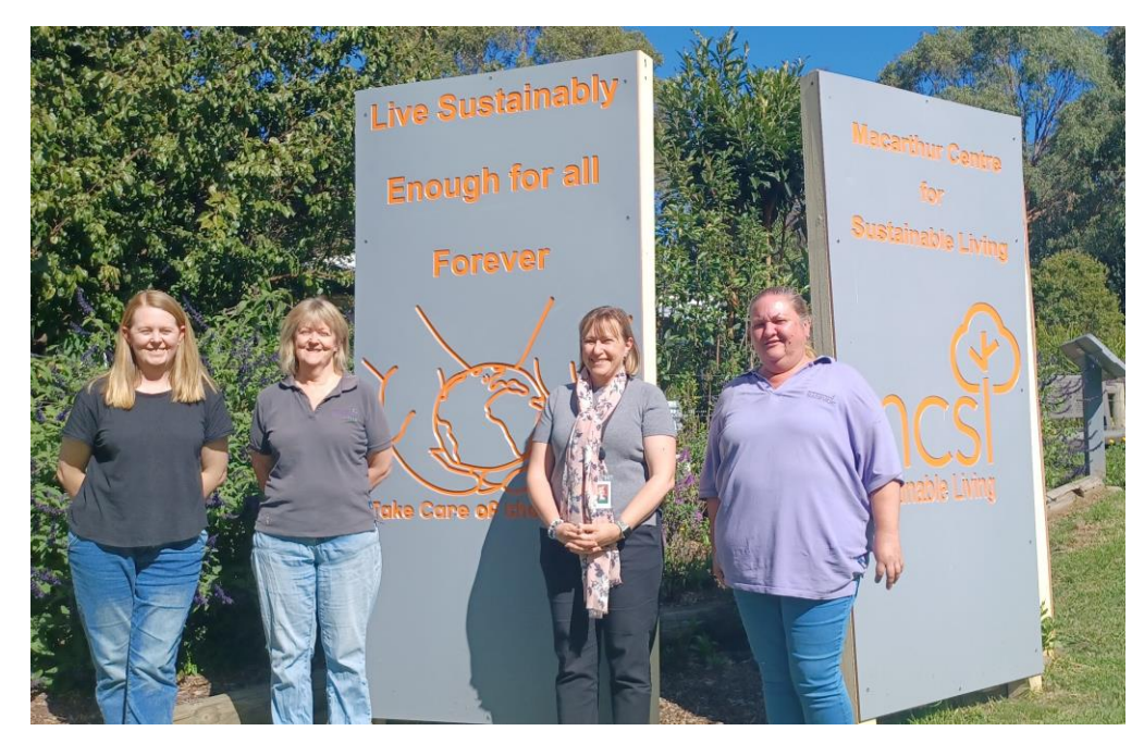
Sally Quinnell MP, Camden with MCSL staff

The Centre continues to collect food from Big Yellow Umbrella to process to assist with food waste avoidance. Approximately 5-10 litres of food waste were recycled in the Centre's worm farms and compost bins each week.